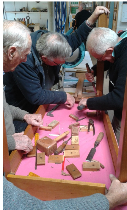
Men at work at the Moss Vale Mens Shed—

* amended extract from the AMSA Australian Men's Shed Association handbook "How to start a Men's Shed" condensed version 2015