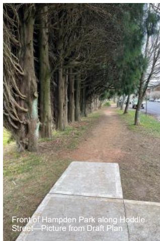
Front of Hampden Park along Hoddle Street—Picture from Draft Plan

Develop a scope of works to construct a shared path along Hoddle Street in front of Hampden Park up to Meryla Street as a priority