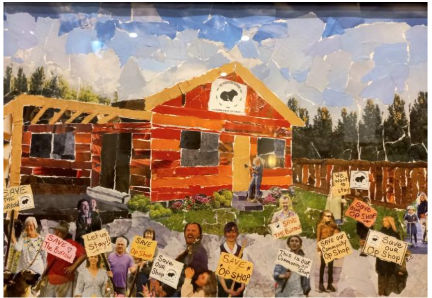
The Protest, collage by Barbara Combe

But there is trouble that needs sorting. The generous lease granted by the landowner cannot be renewed due to redevelopment of the site and