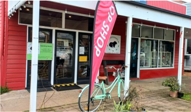
New Robertson Burrow home —picture supplied

We've just completed our first month in our fabulous new premises! Moving was hard work but it's been a great success on many levels. Our takings for the first month were very encouraging, with a significant increase in sales compared to the old premises. We've also received a large amount of donations from our ever generous and supportive community. It's great that our takings are up, but our costs have also increased.