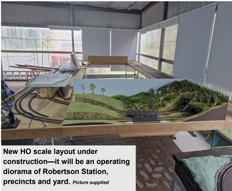
New HO scale layout under construction—it will be an operating diorama of Robertson Station, precincts and yard. Picture supplied

By Angus Webster, Secretary, RHRS Inc The Robertson Railway Station was opened in 1932 when railway services began on the newly-constructed Moss Vale to Unanderra Railway. The station building itself is of designated Pc3 construction (passenger concrete size 3). The nearby Burrawang Station (now demolished) was designated Pc1, of similar construction, but much smaller.