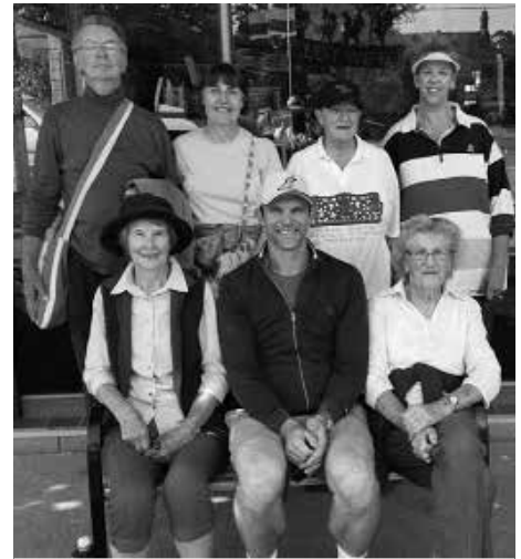
The Robertson Walking Group