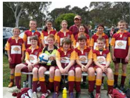
The Robertson/Burrawang Rovers