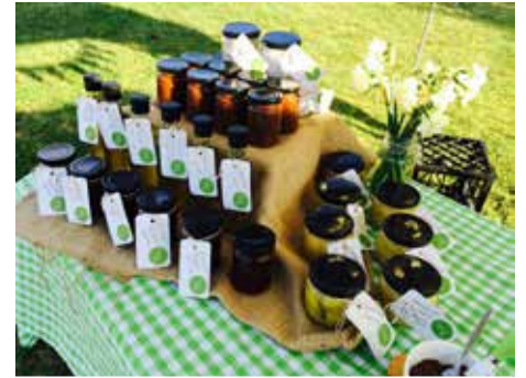
Ally's range of condiments

I now live in Broulee: a little seaside village on the southern coast of New South Wales. Here, I have become accustomed to falling asleep to the sound of the ocean. Working