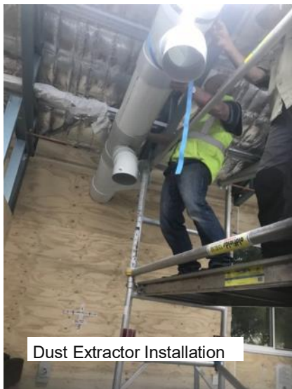
Dust Extractor Installation

Our shed is really becoming more organised and the membership is continuing to increase. We have some exciting things happening. Our AGM is Friday 3 December at 5.30pm.