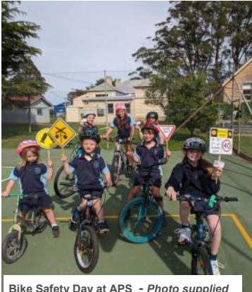
Bike Safety Day at APS

The students have enjoyed a wonderful year of opportunities for learning at Avoca Public School in 2024. This includes Collaboration Days with other small schools, a camp to Milson Island and the