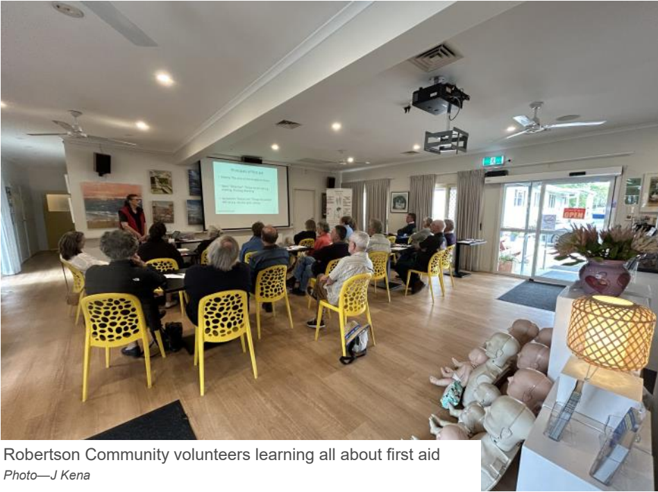
Robertson Community volunteers learning all about first aid

The CTC and RMSI pooled resources to present the training which was held at the CTC. The CTC had received a grant from the Federal Government Volunteer Grants program and RMSI had received funding from the Australian Men's Shed Association. Being able to have so many local volunteers trained was a very successful collaboration between the two groups.