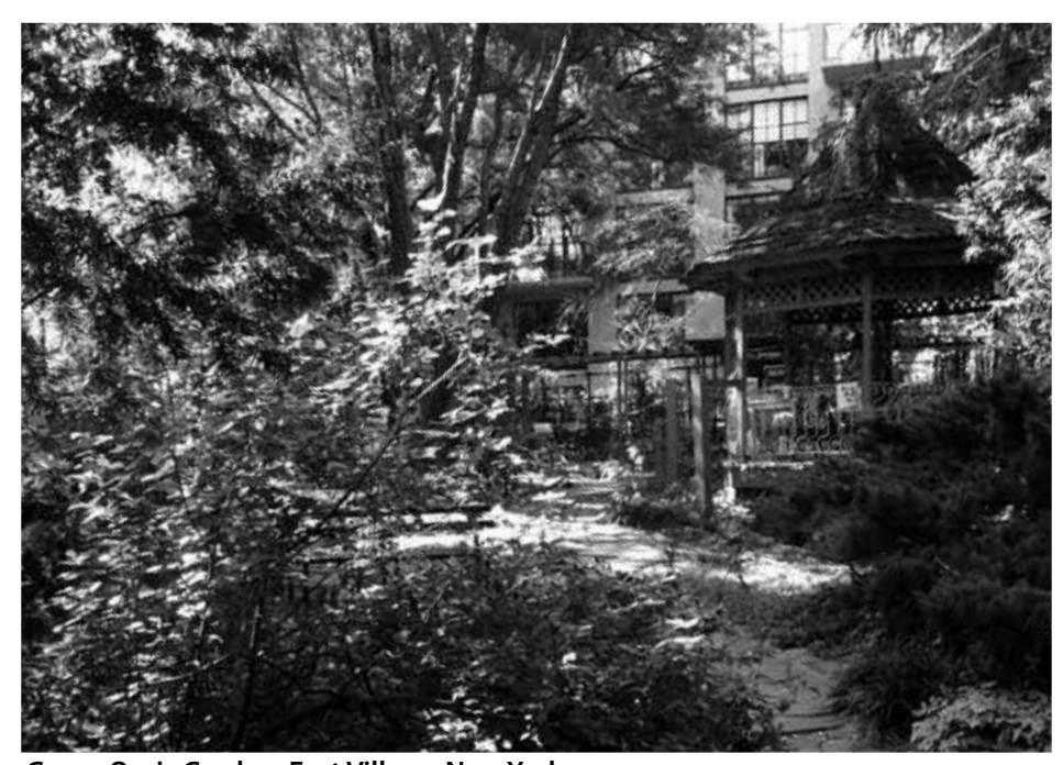
Green Oasis Garden, East Village, New York.