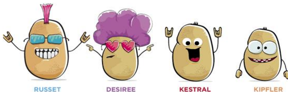
Family of four mascots for the Potato Festival

Expertised Events has just announced it will be presenting a Robertson Potato Festival at the Robertson Showground on the weekend of April 30—May 1 next year. Expertise Events is an independent family-owned event organiser.