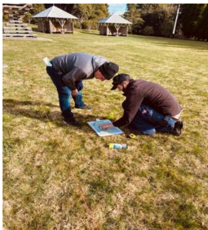
Community Garden volunteers pegging out the garden